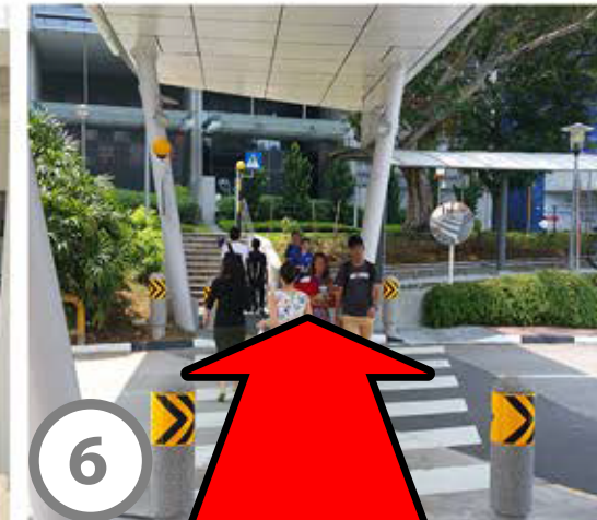
Walk straight and take the pedestrian crossing.