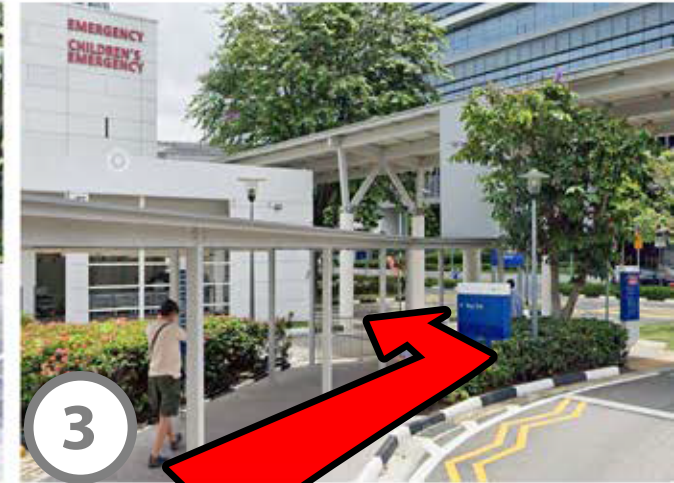
Follow the sheltered path, turn left and cross the zebra crossing towards the Emergency department.