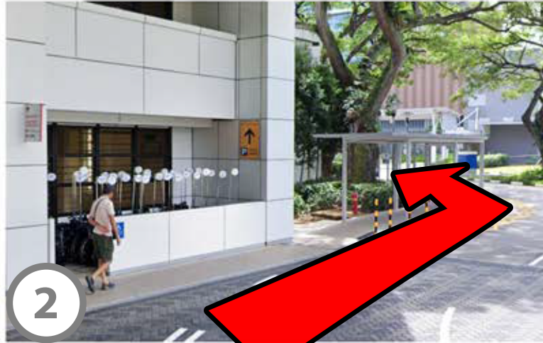
Walk pass the taxi stand and wheelchair bay. Follow the sheltered path , turn left.