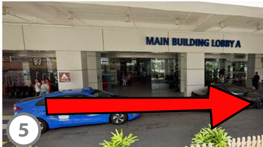
Continue pass 7-eleven and Kopitiam at Main Building Lobby A .