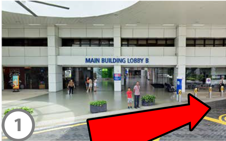
At Circle Line Kent Ridge MRT exit via Exit A and walk pass NUH Main Building Lobby B .