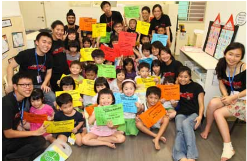
Kids at a local kindergarten learn the importance of hand hygiene

We didn't leave the hotel till 1 in the morning; some groups even went out after. Bright and early on the 20th of January, we went back to the hotel to see our friends off, and hand them their photos of group 20 in wooden photo frames. We also offered to take a couple of Hong Kong delegates to Chinatown in the morning for a Singapore breakfast of kaya toast and soft-boiled eggs. They said it made their trip.