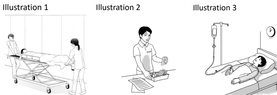
Figure 1. Illustrations used in S-KY and W-KY

We conducted the S-KY and W-KY for 120 medical students half a year after admission in 70-minute compulsory classes. The purpose of these classes was to teach diversity of thinking and thinking of others through discussions in small groups of seven to eight people. The S-KY and W-KY were conducted over two classes (140 minutes). Specifically, the students conducted group work in the following order using three kinds of illustrations (Figure 1) depicting clinical sites. In our class, after individual students brainstormed ideas, they shared ideas with others and learned about the diversity of ideas.