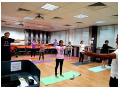
Starting from 07 August 2018, Physiology organised Yoga every Tuesday evening.