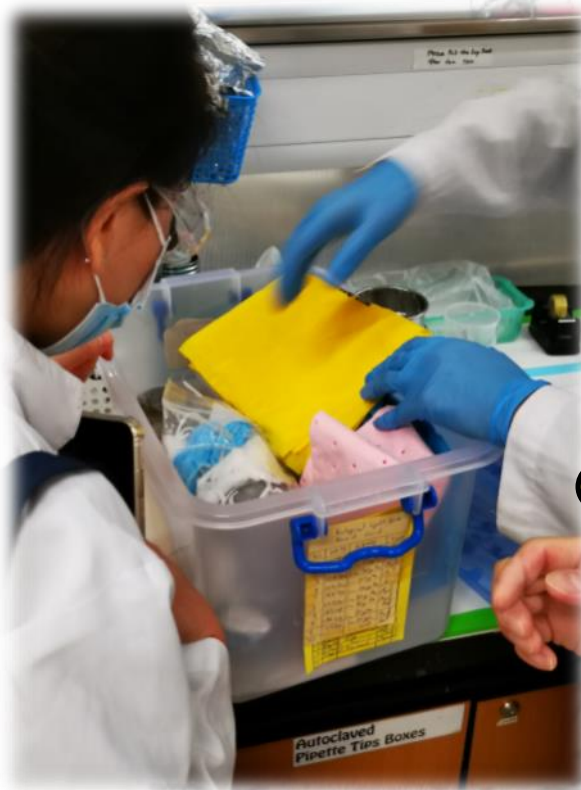
Checking of the biological spill kit items by the OSHE auditor

I hope there is no expired items inside!!