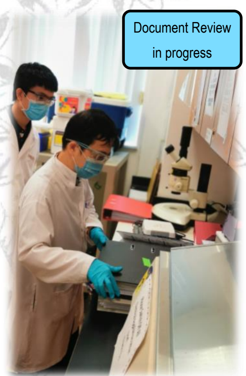
Document Review in progress