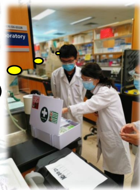
Checking of First Aid box items by OSHE auditor