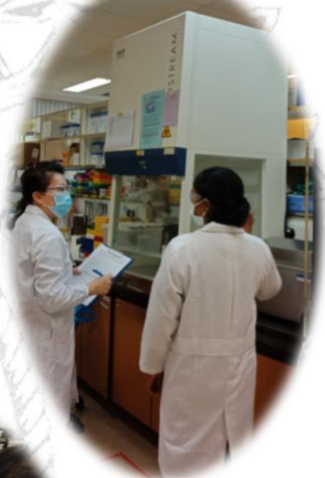
Start of the physical lab inspection by the OSHE auditor