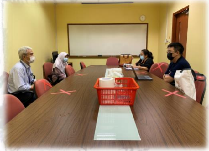
Closing Meeting with sharing of audit findings by the OSHE auditors