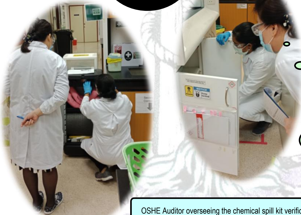
OSHE Auditor overseeing the chemical spill kit verification in the laboratory