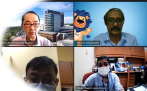
Online Interview of the PI & key group members through Microsoft Teams