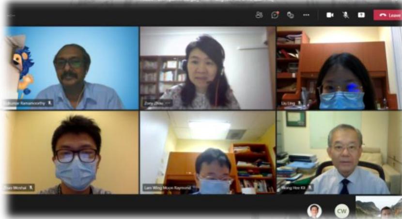
Online Interview of the PI & key group members through Microsoft Teams