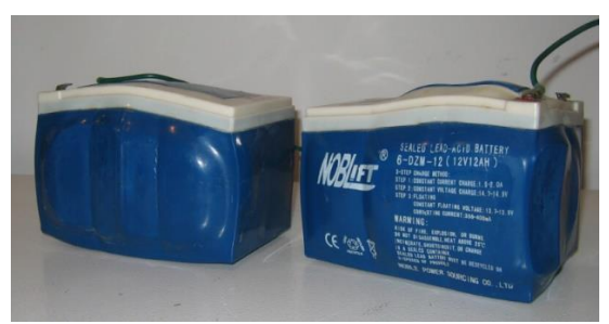
Figure 12: Bloated lead acid batteries