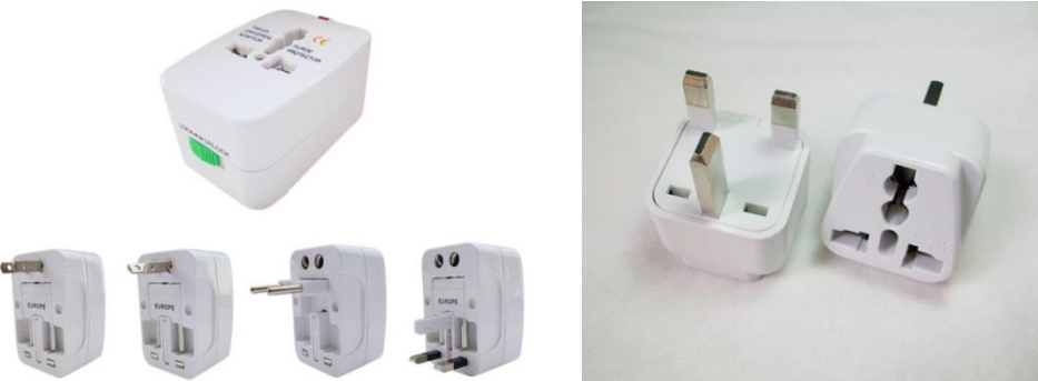
Figure 5: Examples of universal travel adapters