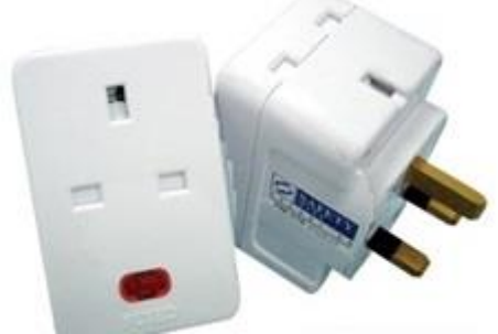
Figure 4: Example of a multi-plug adapter

• All plugs inserted in a multi-plug adapter should be labelled with the respective current rating (in Amperes) of the equipment. The current rating of the equipment is usually listed on the equipment. Alternatively it can be obtained by dividing the power rating of the equipment in Watts by 220 Volts.