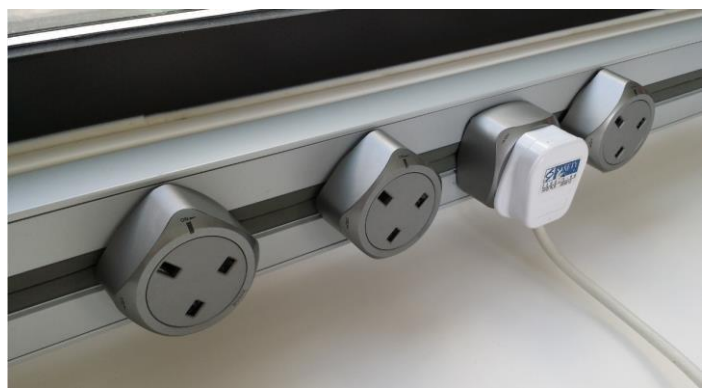
Figure 9: An example of a power track system