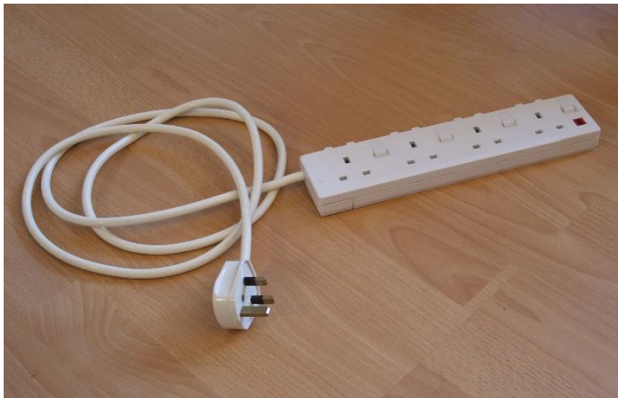
Figure 7: An example of an extension cord

8.4.1 Extension cords (Figure 7) supplement fixed wiring by providing the flexibility required for maintenance, portability, isolation from vibration, and emergency and temporary power needs.