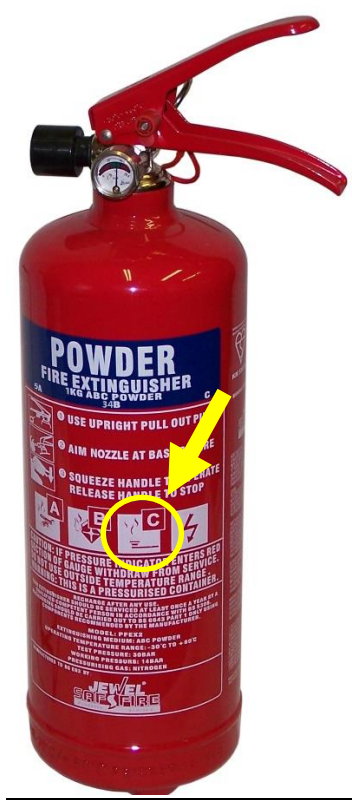
Figure 13: Example of a fire extinguisher that can handle electrical fire (Class C fire)

If an electrical fire occurs, try to disconnect the electrical power source (pull the plug or trip the circuit breaker), if possible. Use a Class C or multipurpose (ABC) fire extinguisher (Figure 13) to extinguish the fire if it is small and will not pose immediate danger to personnel. NEVER use water to extinguish an electrical fire. Activate the fire alarm and remove any unconscious victims from the vicinity of the fire. Notify Campus Security immediately at 6874 1616. Refer to this link for more information on training on using fire extinguishers and fire safety training <u>https://inetapps.nus.edu.sg/osh/portal/shmgt/ssts.html</u>